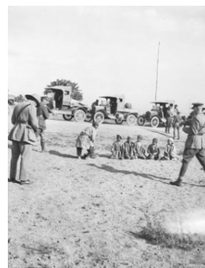
Ford Vans - Mesopotamia.