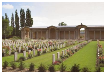
The Arras Memorial