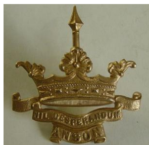
The Cap Badge of the Anson Battalion