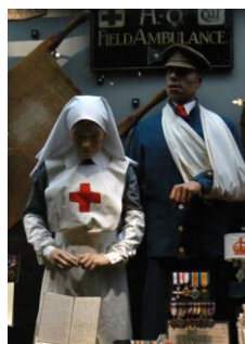
Voluntary Aid Detachment Uniform