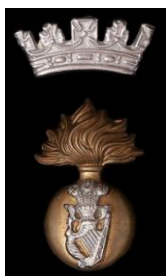
The Cap Badge of the Princess Victoria's (Royal Irish Fusiliers)