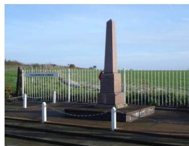
63 rd (Royal Naval Division) Memorial Blandford Camp, Dorset