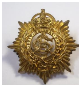
The Cap Badge of the Army Service Corps